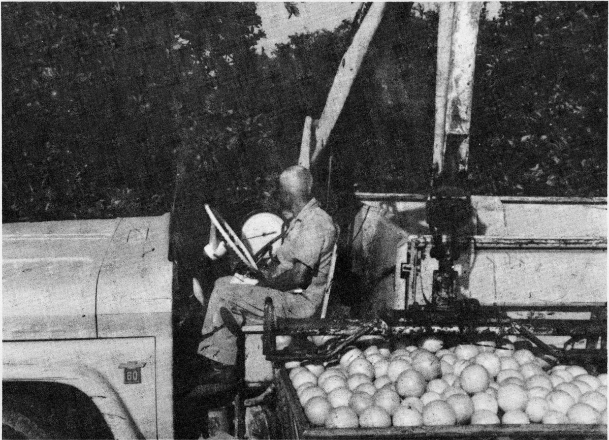
Fig. 2 The fruit-weighing system used to keep records of individual tree yields employed a hydraulic load cell in the loader boom.