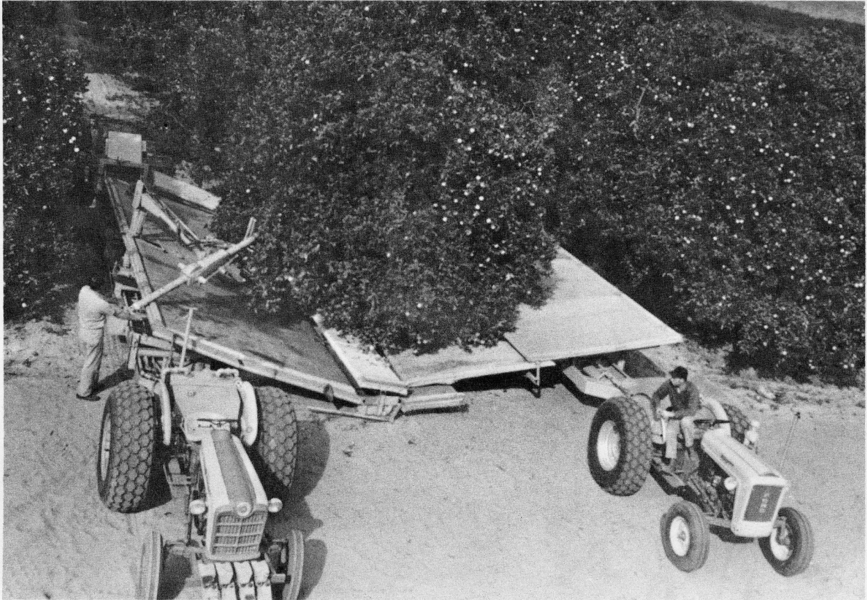
Fig. 1 The complete tree shaker catching frame harvest system used throughout most of the harvest trials.