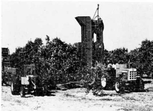
Fig. 1. Front view of FMC-3 harvest system. The air shaker is the vertical tower on the right. Air was discharged at 100 mph from 2, 10-inch wide openings, 20 feet high, 39 inches apart, and converging at a 30° acute angle. Air was oscillated by wobble plates at 70 cpm.

A harvesting experiment was set up in each variety in a similar manner as follows. Twenty-four trees were included in a split-plot-in-space-and-time (season) design with 4 replications. Each replication was split into 2 main units. One main unit was sprayed with an abscission chemical. The other was left as a control for the chemical treatment. Each tree received approximately 15 gallons of spray mixture. In 1969, 'Hamlins' and 'Parson Browns' were sprayed with hexamic acid (2 lb./tree) while 'Valencias' were sprayed with cycloheximide at 20 ppm (4% cycloheximide, 23 ml/tree). In 1970, a 20 ppm mixture of cycloheximide (CHI) was used on all 3 vari-